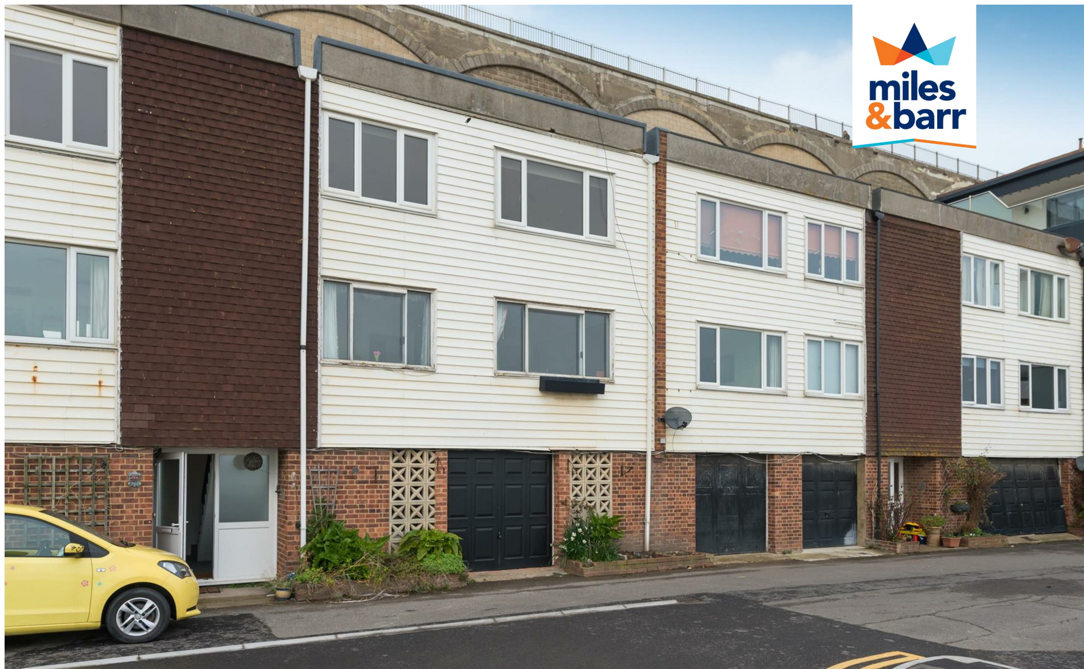
GRANVILLE MARINA COURT RAMSGATE